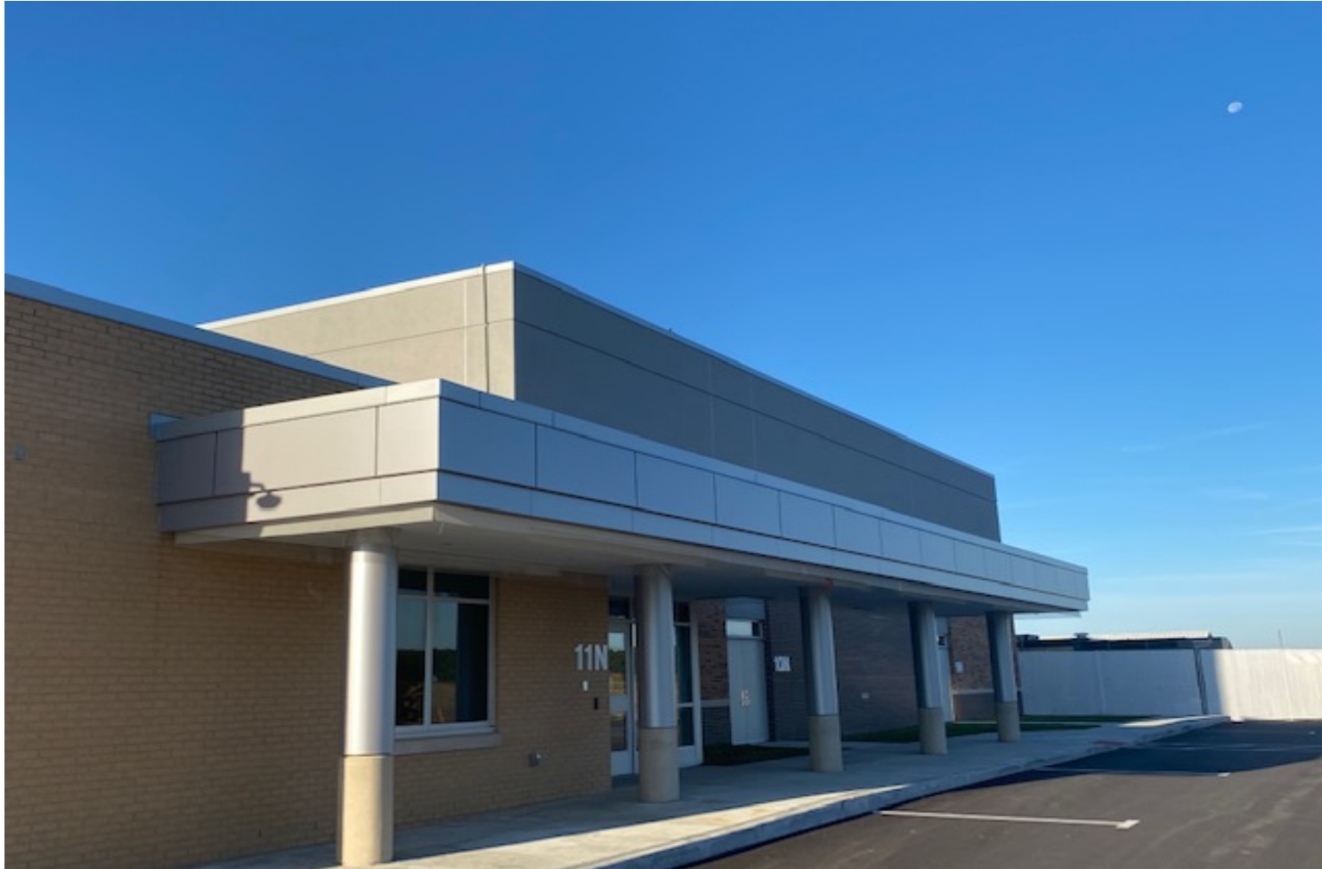
North Gym/Administration Entrance